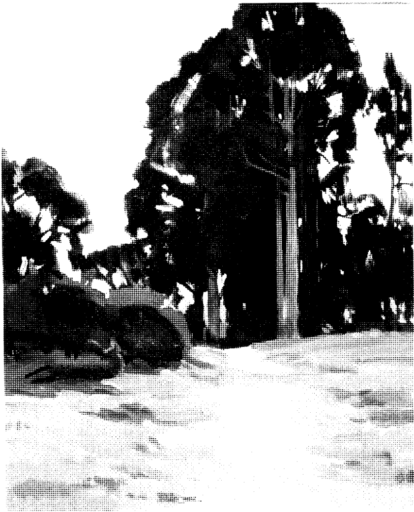
The completed painting: Spring Light at the Wilcox Property , 1995, acrylic, 24 x 20. Collection the artist.