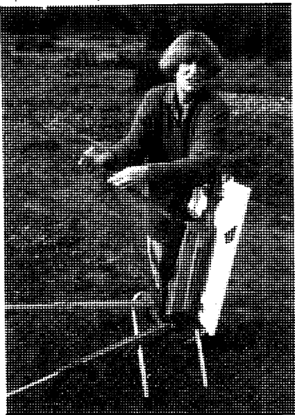
My trusty French half-easel sets up in a flash.

After a few painting sessions, the tackle box I use as a paint box won't look so pristine, but the paints will remain moist and usable for months.